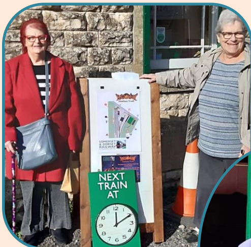
Swan Passengers enjoying their day out